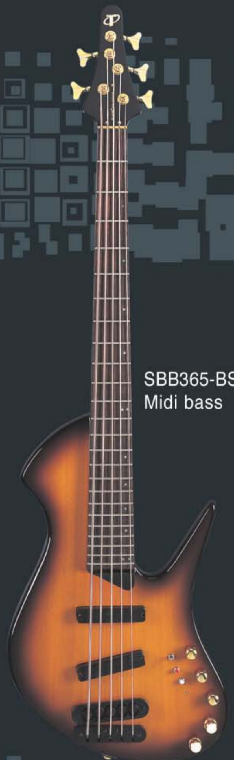
SBB365-BS Midi bass