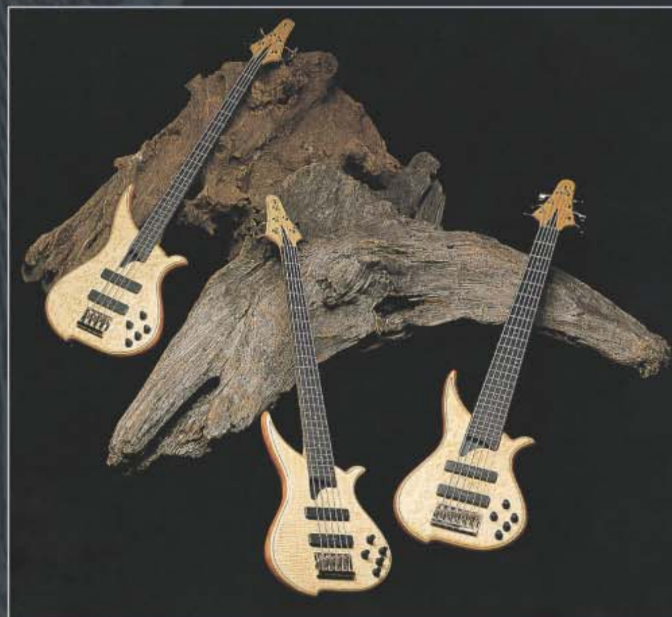
Available as custom order